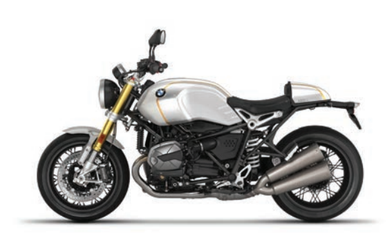
BMW R nineT Mineral White Metallic/Aurum