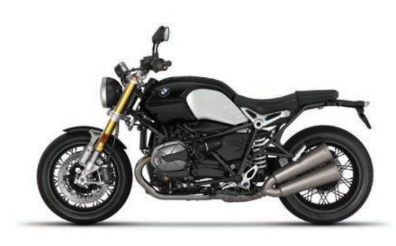
BMW R nineT Blackstorm Metallic/Brushed Aluminium