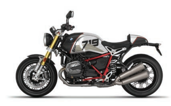
BMW R nineT Night Black Matt/Aluminium Matt