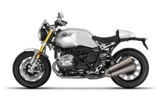
BMW R nineT Option 719 Aluminium