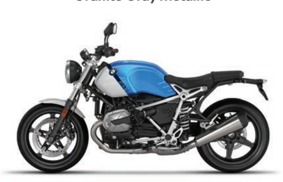
BMW R nineT Scrambler Cosmic Blue Metallic/Light White