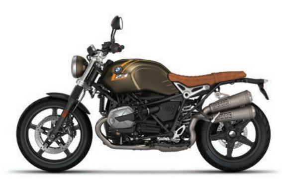
BMW R nineT Scrambler Kalamata Metallic Matt