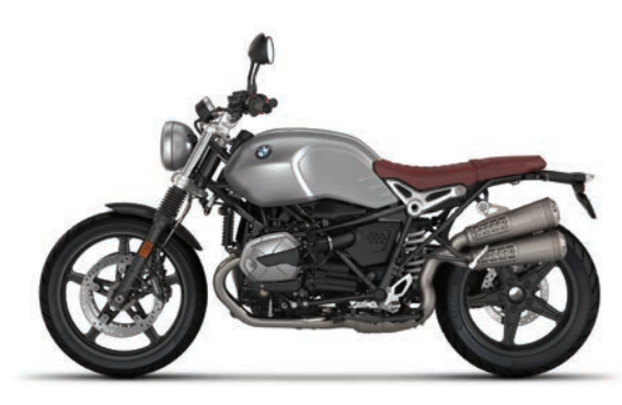
BMW R nineT Scrambler Granite Gray Metallic