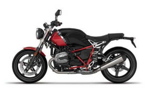
BMW R nineT Scrambler Black Storm Metallic/Racing Red